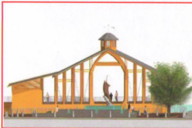
An artist's rendering of the Jib Project. When finished, it will be a beautiful and practical addition to the Morehead City Waterfront.