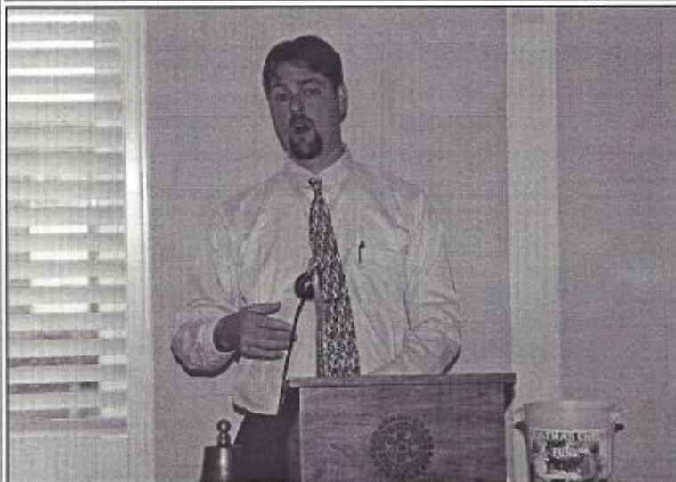
There is a convergence of information in today's hospitals