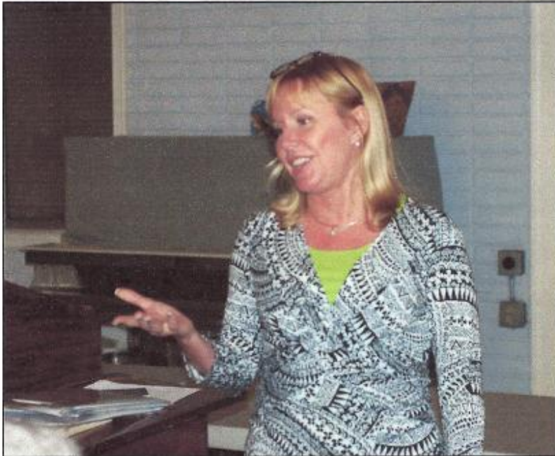
"It's never too late to develop a financial plan"