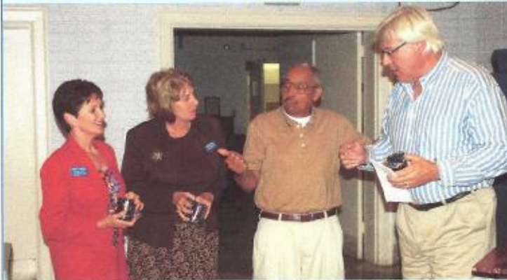
"Rotary Cups for Everyone. We have an endless supply"