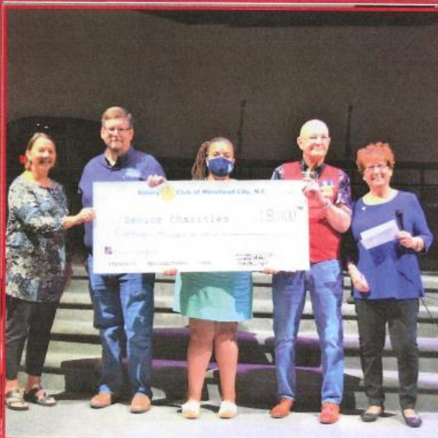
Balsam Range Concert Raised $18,000 for Carteret County Senior Charities

District 7730, Club Number 6167 https://www.rotarymhc.org/