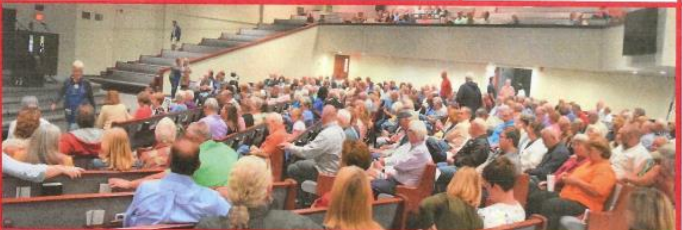
Balsam Range Concert Draws Huge Crowd of Bluegrass Fans