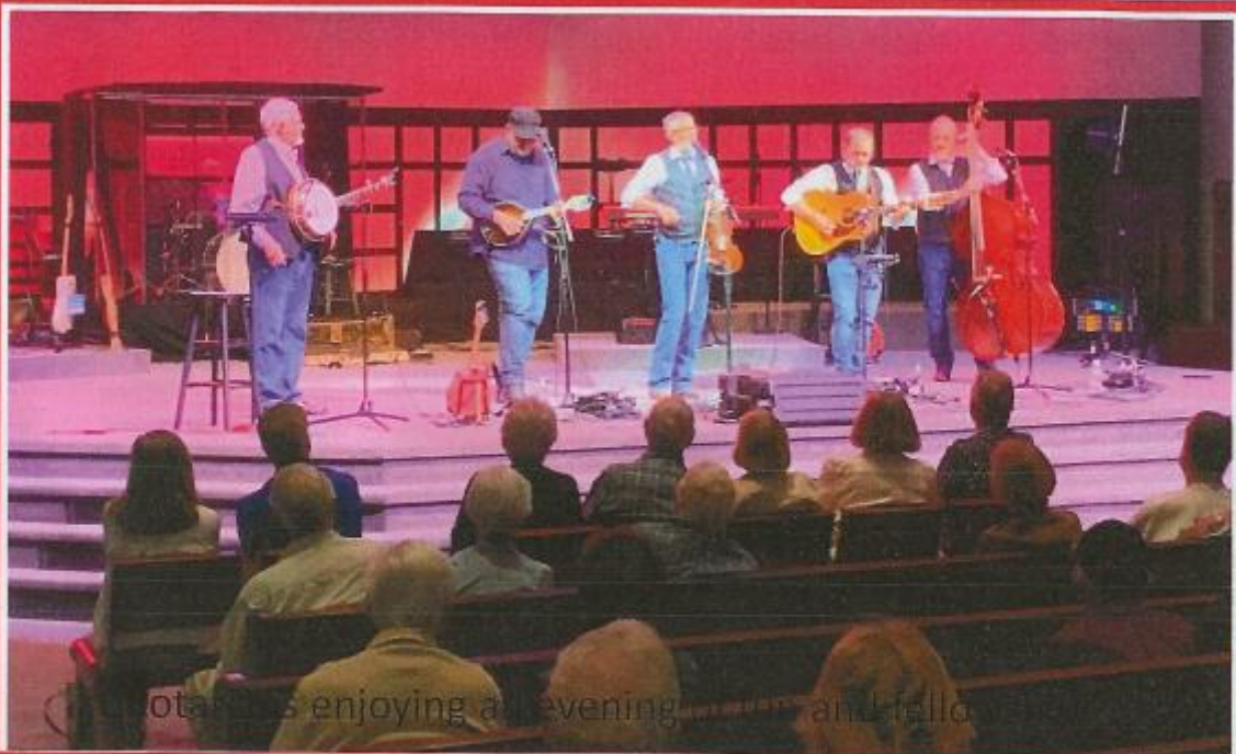
Rotarians enjoying an evening with their friends and fellow