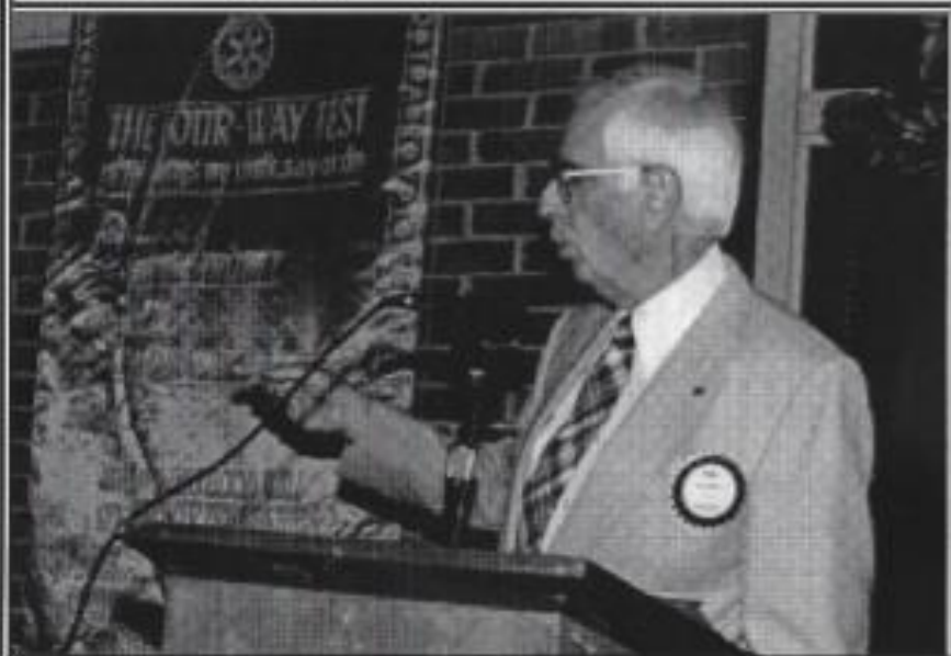
"Oh, To be in England again"