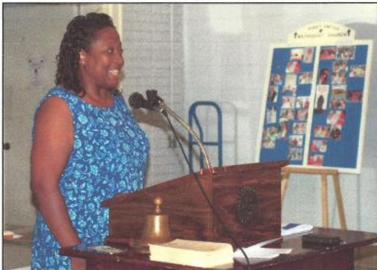
The little school that survived budget cuts.