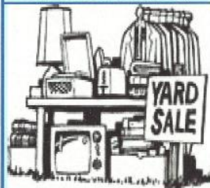
It is time to turn in your list of yard sale items to Dick Rogers