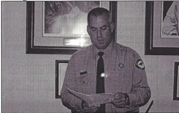
Randy Newman, our guest speaker, loves to sing.

In the future, the president will give speakers a minimum of 20 minutes for their presentations. All Rotary business will be completed by 6:40 pm. If it is anticipated that the meeting will be long, to conserve time, the president will make announcements and discuss business while the club is eating.