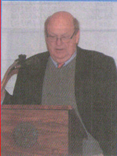
"Now tell me who is buried in Grant's Tomb?"