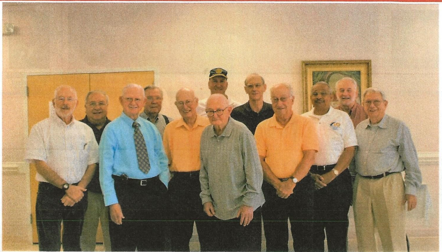
Throwback Thursday Picture: Remembering the Stalwarts of the MC Rotary Club!