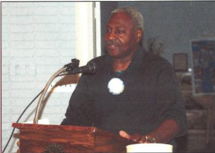
Whoever takes the Son gets it all.