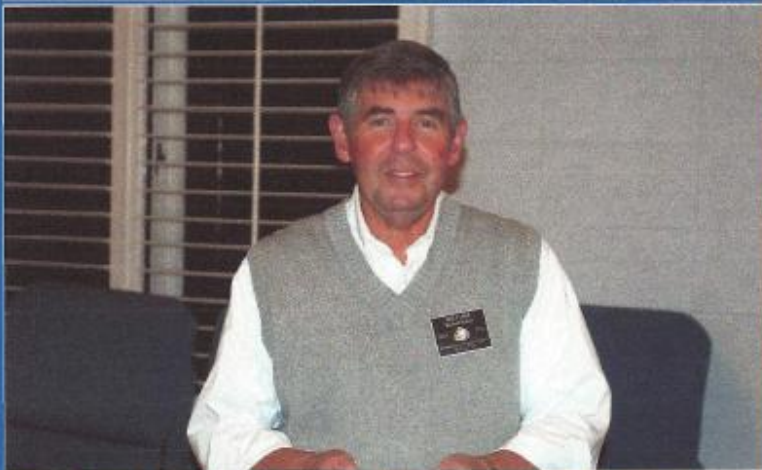
Hosting a GSE team member is a great opportunity to learn about Argentina