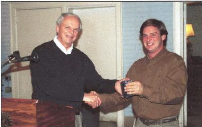
Let the word go forth from this time and place: the coffee mug has been passed to a new generation of Rotarians.