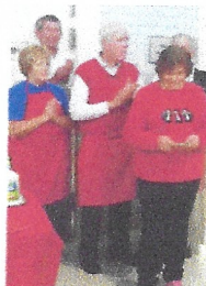
The Christmas Cheer Team

District 7730, Club Number 6167 http://rotarymhc.weebly.com/