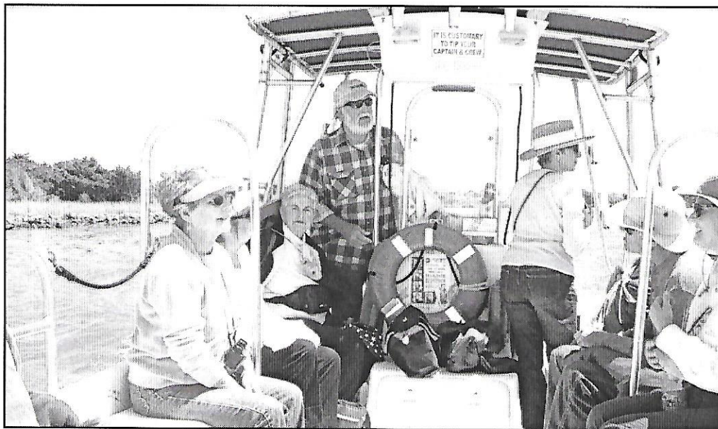
On the ferry to Portsmouth Island