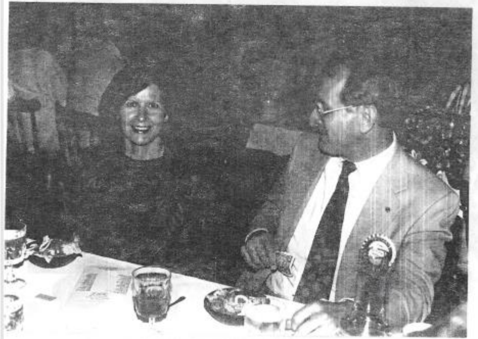
AND A GOOD TIME WAS HAD BY ALL !!