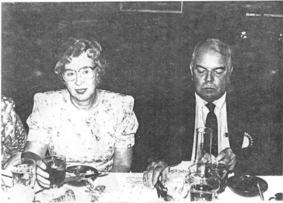
AND A GOOD TIME WAS HAD BY ALL !!