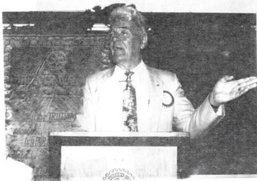
"My fellow Rotarians, ask not what Rotary can do for you...."