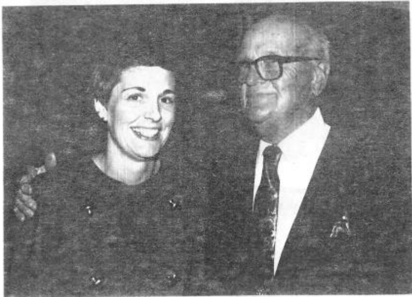
"Let me call yo sweetheart. I'm in love with you. Let me hear you whisper that you love me too."