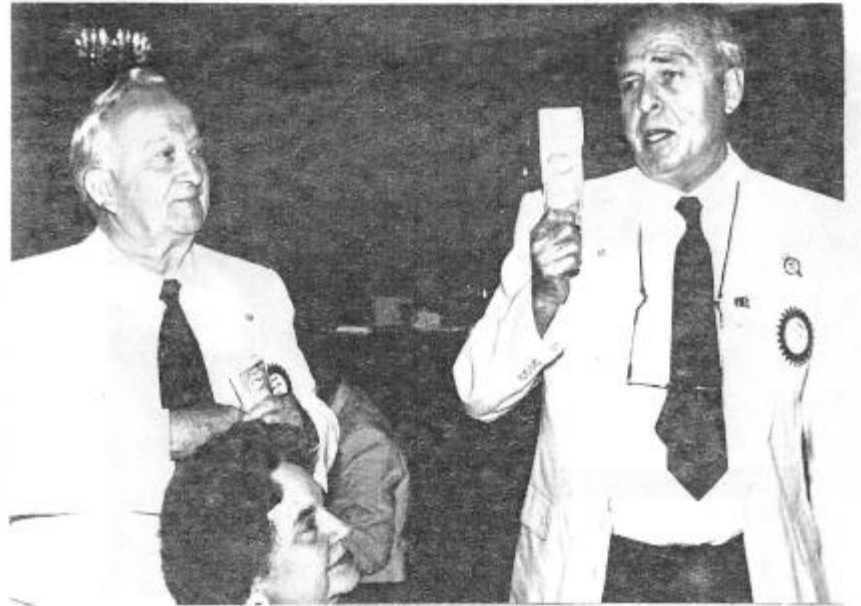
"Julian, surely you wouldn't take a fellows last dollar, would you?"