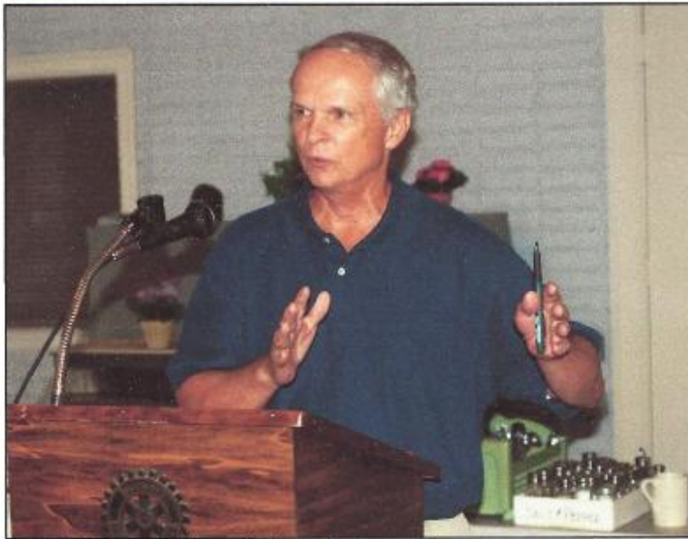
"Great is the reward to those who honor God's word."