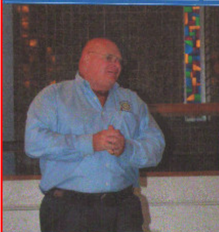
I want to thank you for inviting me to install your officers and board of directors tonight. It has been a real honor.