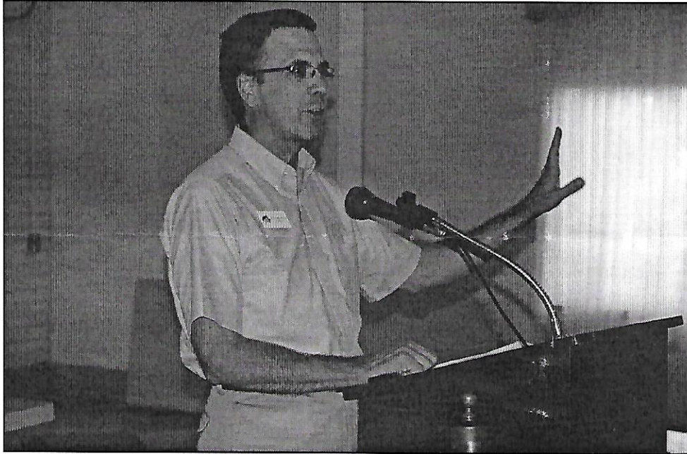
NC Aquarium Has Many Projects Underway