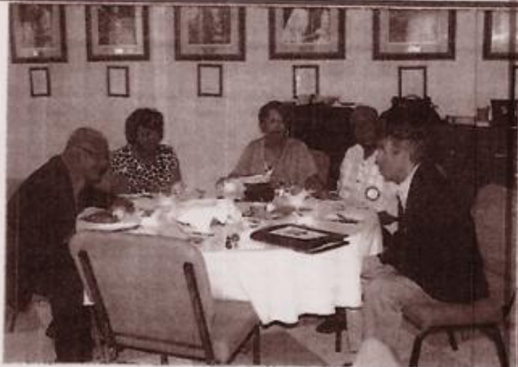
Everyone at this table seems to be having a good time.