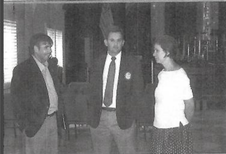
Scenes from the 2013-2014 Rotary Officer Installation where a good time was had by all!!