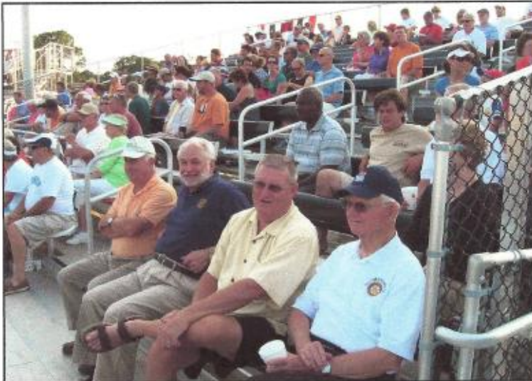
Buy me som popcorn and cracker jacks!