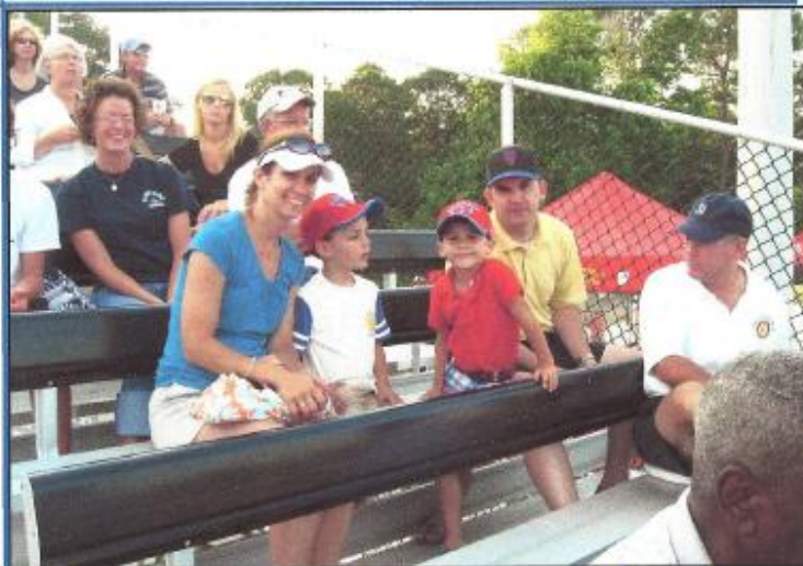
What's more fun than taking your family out to a baseball game...especially if it is your sons first ball game.