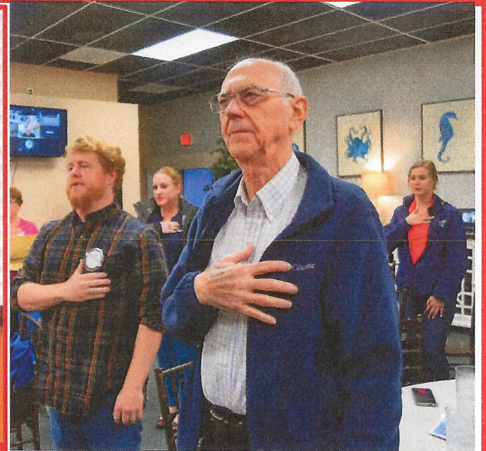
Rotarians are patriotic