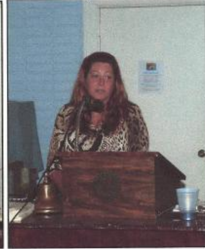
C-STEP off to great start with three first completers