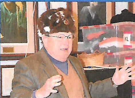
"It was so cold, without this hat, my ears would have frozen off."

The SA's three main sources of revenue come from the Red Kettle Campaign, the thrift store in downtown Morehead City and individual and corporate donations. The SA's motto is "Doing the most good." A lofty motto which SA employees carry out in action and deed.