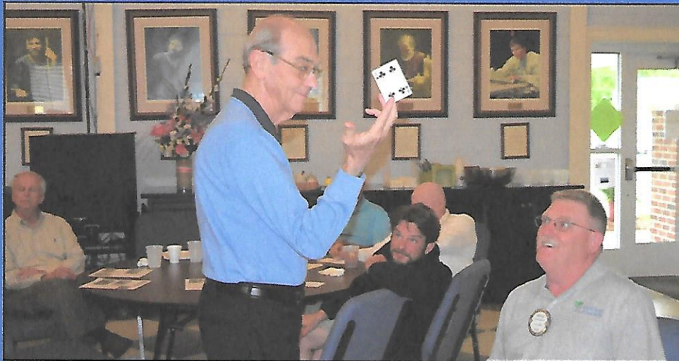
With only 14 cards in the deck, you would think someone would have drawn the Ace of Spades by now. Even with only 14 cards, it is still like finding a needle in a haystack.