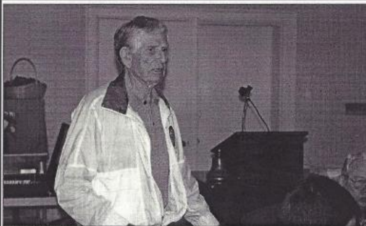
Timing is Everything!