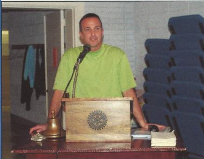
All this and the beach too!