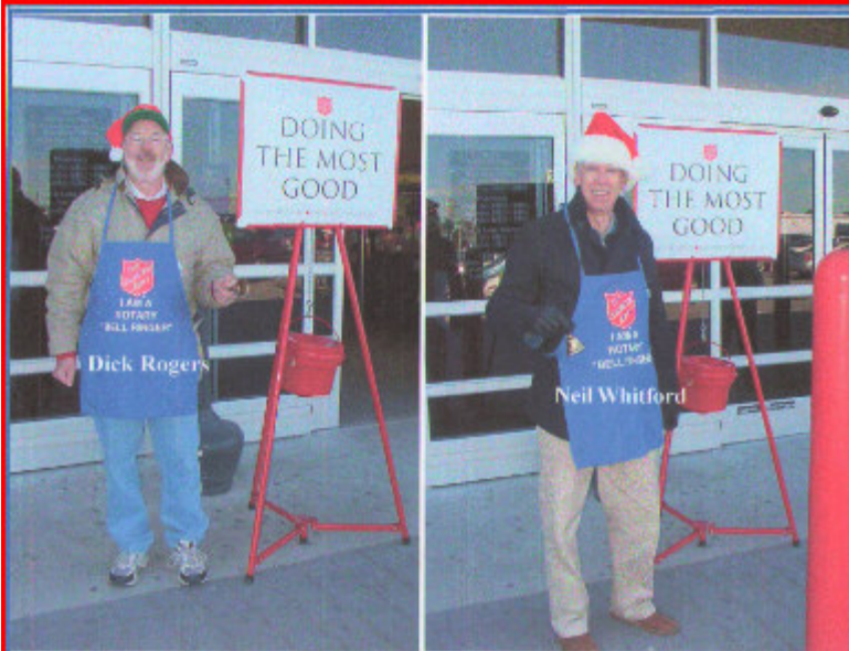
Red Kettle Bell Ringers from Last Year