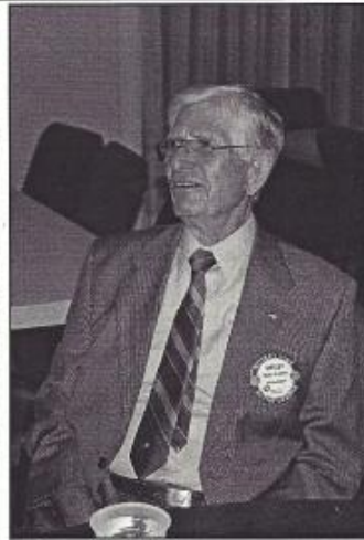
The Greatest Generation Honored