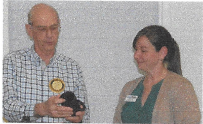
THE 4-WAY TEST