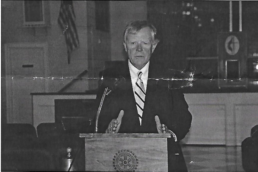
"Juries work amazingly well."